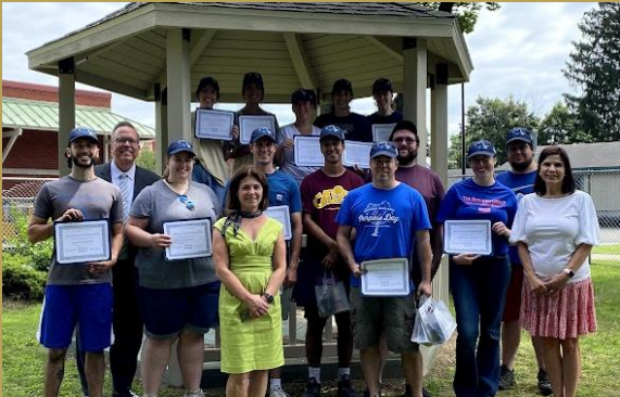
Grateful for the many volunteers!