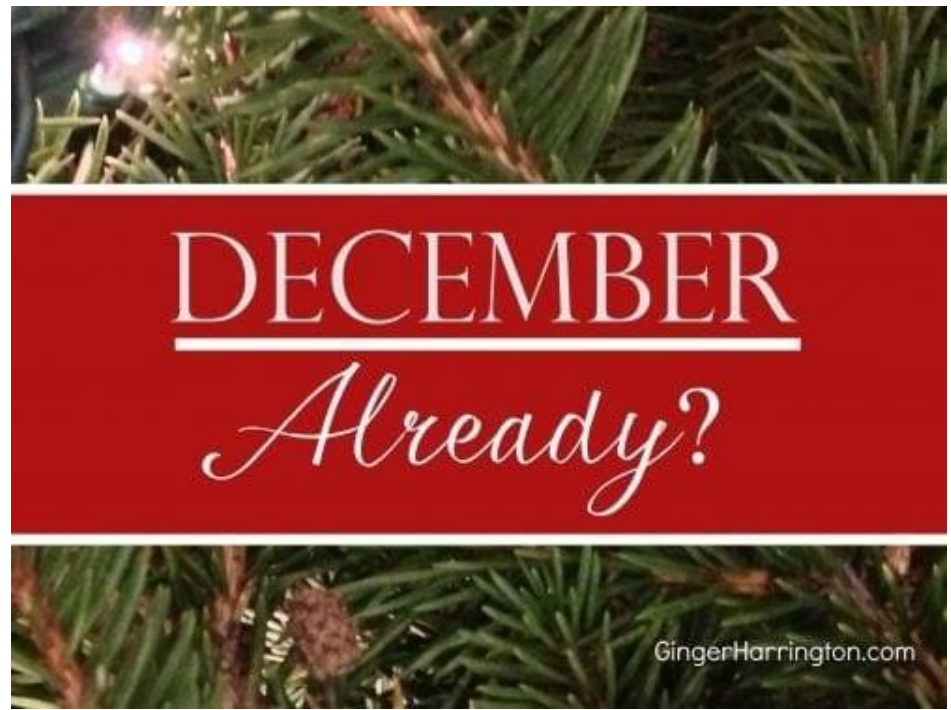
St. Anne Institute - News & Notes